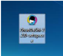
Fig(1). ZhouDaShi Installer Image